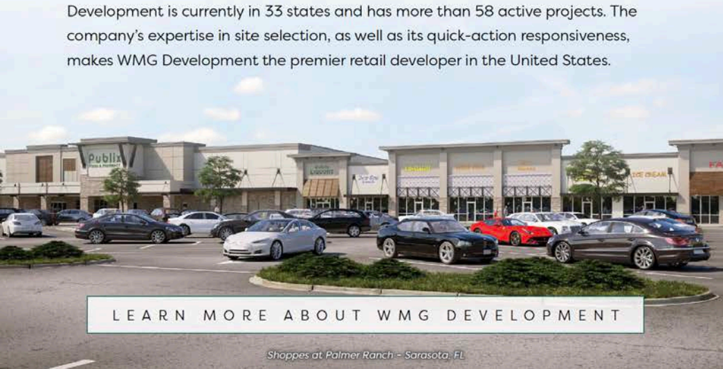
Shoppes at Palmer Ranch - Sarasota, FL