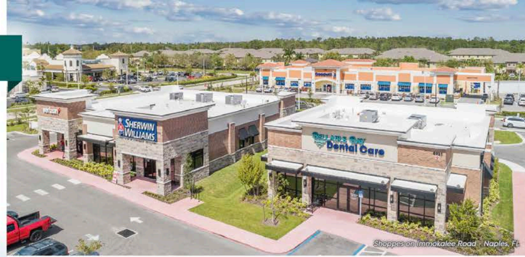
Shoppes on Immokalee Road - Naples, FL

Throughout the years, WMG has executed a solid track record of successful development solutions. WMG develops commercial real estate projects for a variety of industry segments, including retail, healthcare and restaurants. WMG Development is currently in 33 states and has more than 58 active projects. The company’s expertise in site selection, as well as its quick-action responsiveness, makes WMG Development the premier retail developer in the United States.