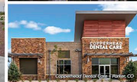
Copperhead Dental Care - Parker, CO