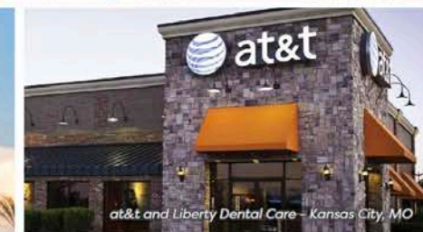
at&t and Liberty Dental Care - Kansas City, MO